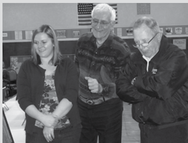
Contest judges critique each photo.