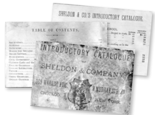
1884 Introductory Catalogue of Sheldon & Co. Textbooks

This is a complete 18-page catalog of high school and college textbooks available. It was printed in a small format, with pages measuring only 3½" x 5." The "Table of Contents" (shown) lists 26 different school subject from "Arithmetic" to "Speakers" for which books were available. Two prices were listed for each book. If you were making a new purchase, you had to pay the "Introductory Price." But, if you had an old book of the same grade level to return, you would pay the "Exchange Price," which was much less.