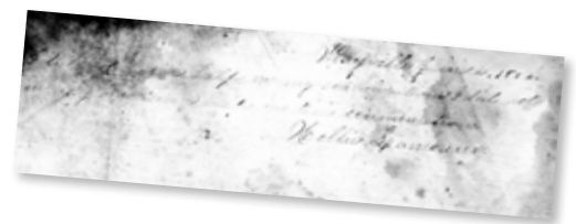
1882 Students accused of cheating