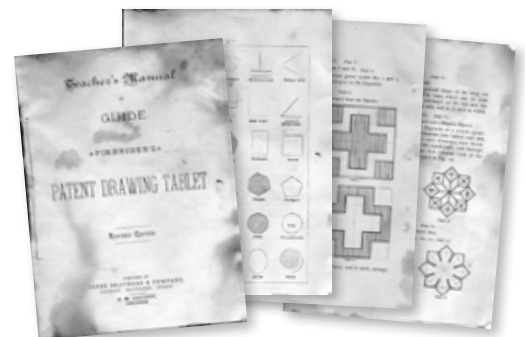
1880 Teacher's Manual for Patent Drawing