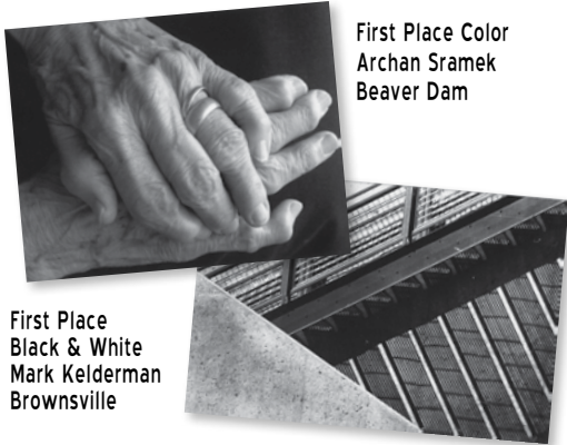
First Place Color Archan Sramek Beaver Dam